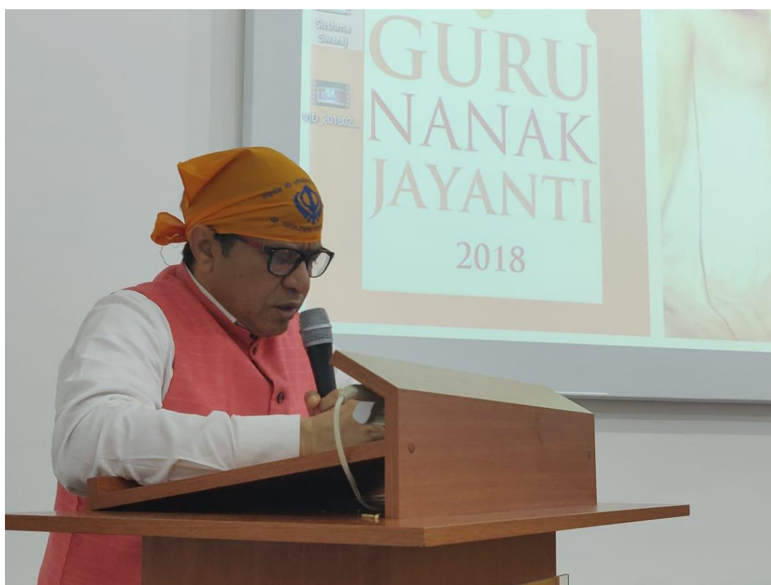
550 th Celebration of the Birth Anniversary Guru Nanak (Universal Brotherhood Day) by the Cultural Centre and the Indian community in São Paulo on 24 November.