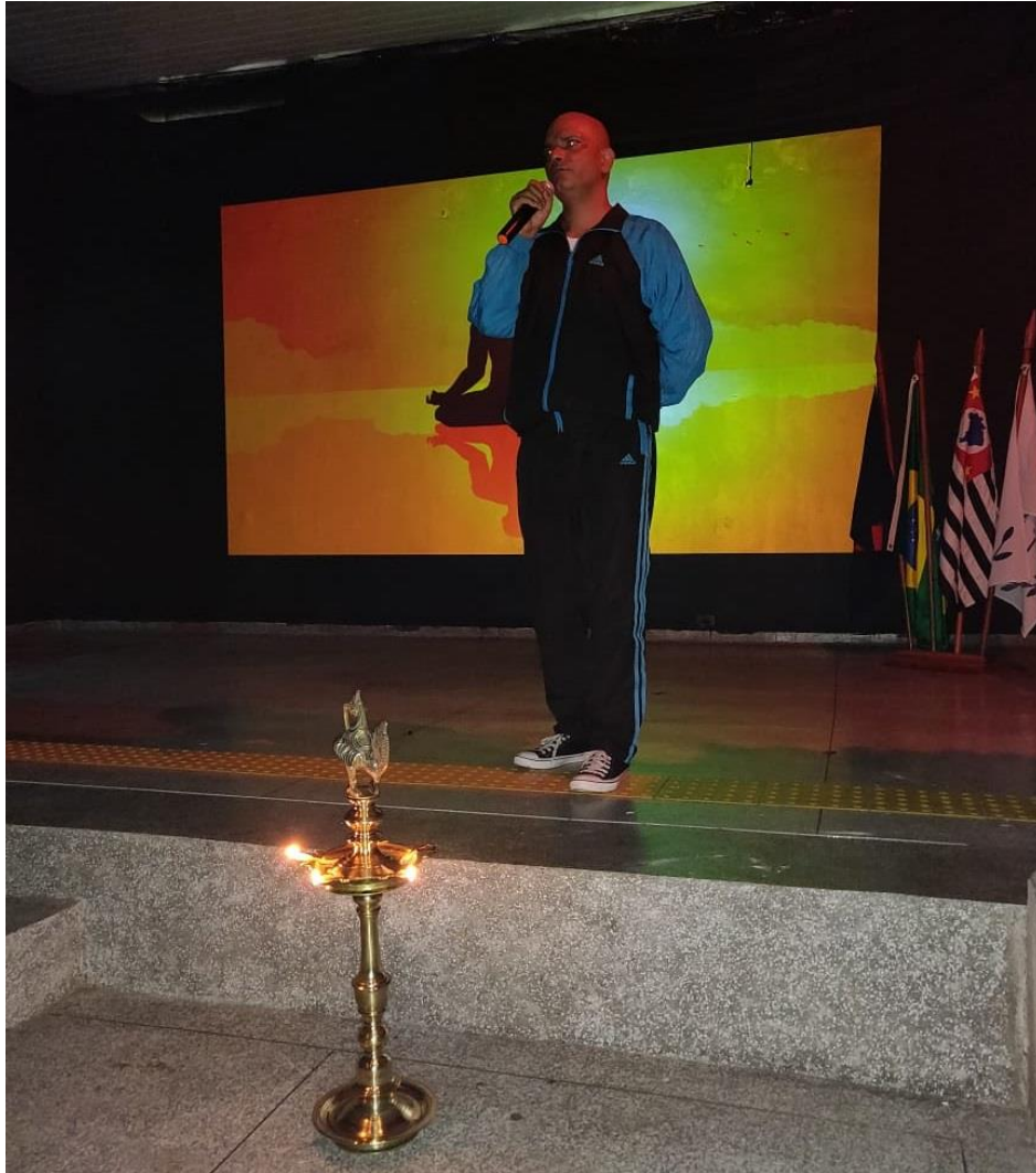
Opening ceremony of the Climate Change Conference organized by the Indian International Model United Nations (IIMUN) at the E. E. João Amos Comenius (State School) with the presence of CG and ICC-Dir. Cultural performance of Odissi by a Rasananda troupe dancer and meditation session by TIC on 30 November.